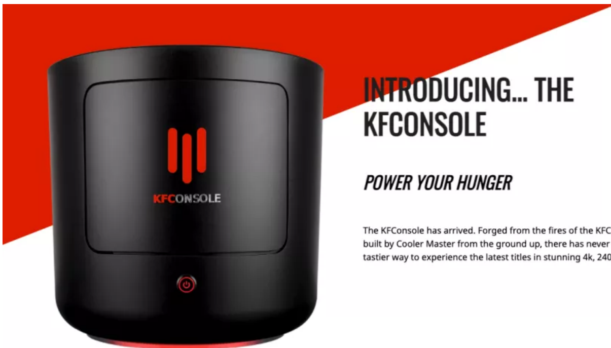
Nothing can surprise us in 2020

But it seems Cooler Master is also confident about the KFCConsole's gaming prowess. According to the company, the console is capable of running "the latest titles in stunning 4k, 240fps". With Asus-powered graphics and an Intel Nuc 9 chip, it seems the KFCConsole is essentially a glorified gaming PC. Which heats chicken. (Vegetarian gamers: here's where to buy a PS5 .)