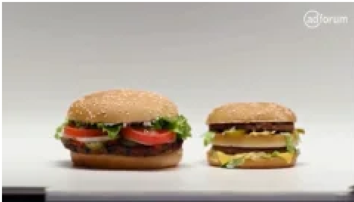
The secret behind the Whopper (/case-studies/the-secret-behind-the-whopper)