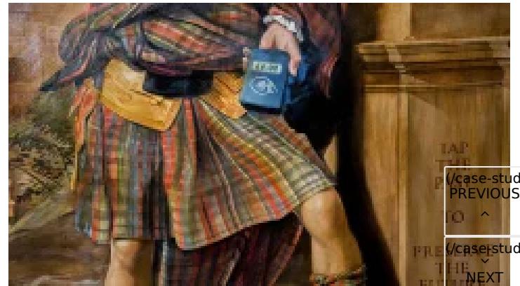
A great Scots way of fundraising (/case-studies/a-great-scots-way-of-fundraising)

NEWS (/NEWS) AGENCIES (/AGENCY) PRODUCTION COMPANIES (/PRODUCTION) CREATIVE WORK (/CREATIVE-WORK) AWARDS (/AWARD-ORGANIZATION) DIRECTORIES (/DIRECTORIES)