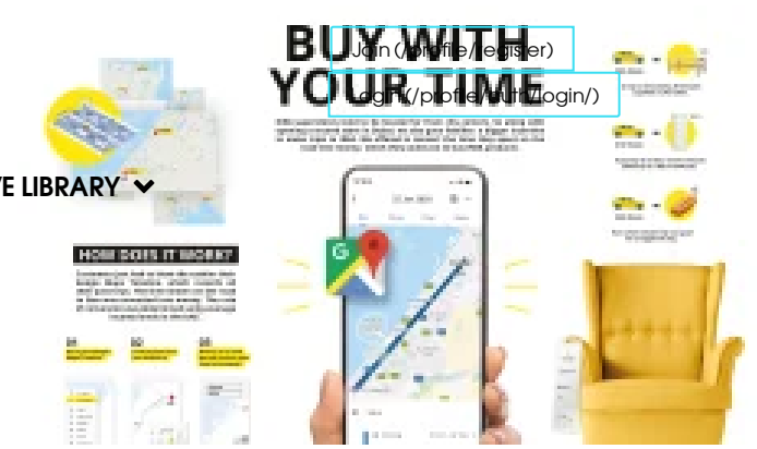
At Ikea, Time Really Is Money (/case-studies/at-ikea-time-really-is-money)