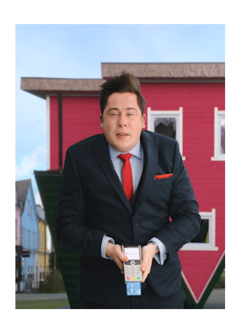
Barclaycard - Upside Down House