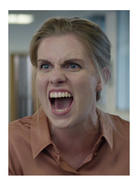
AMAZON PRIME VIDEO Amazon Prime Video