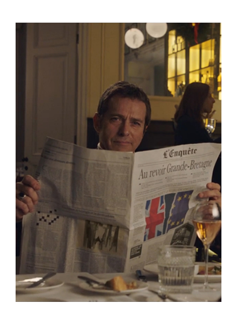
ANCESTRY UK Together Forever