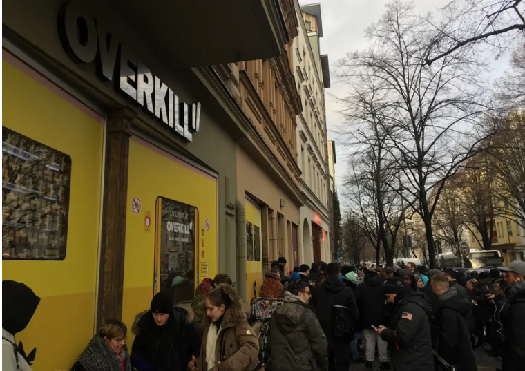
Shoppers queue outside Overkill in Berlin to get their hands on the limited edition trainers.