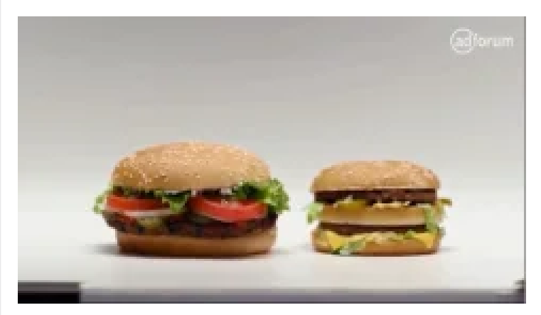
The secret behind the Whopper (/case-studies/the-secret-behind-the-whopper)