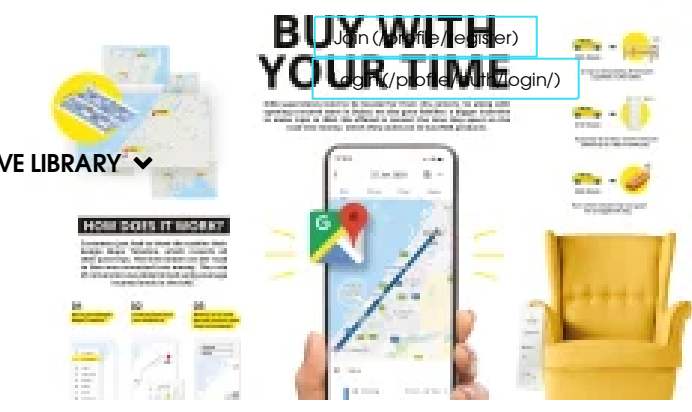
At Ikea, Time Really Is Money (/case-studies/at-ikea-time-really-is-money)