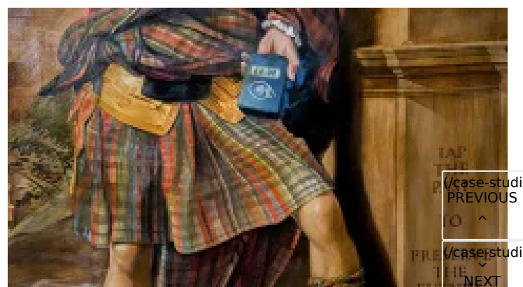
A great Scots way of fundraising (/case-studies/a-great-scots-way-of-fundraising)

NEWS (/NEWS) AGENCIES (/AGENCY) PRODUCTION COMPANIES (/PRODUCTION) CREATIVE WORK (/CREATIVE-WORK) AWARDS (/AWARD-ORGANIZATION) DIRECTORIES (/DIRECTORIES)